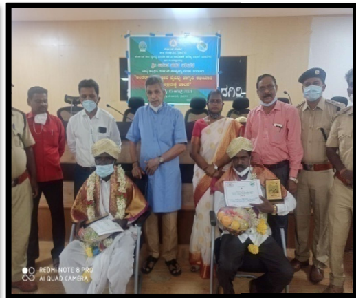
Achievers being awarded and felicitated for the year 2020-21