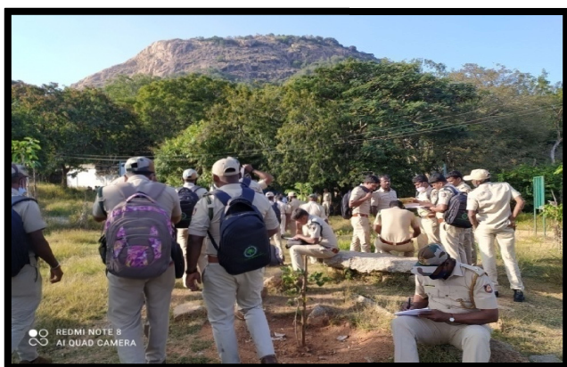
Training for Chamarajnagar Circle Forest Officers and Frontline Staff