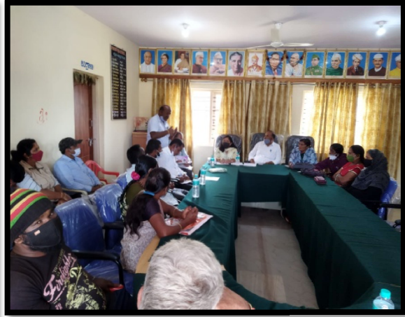
IBD Celebrations at Antharasanthe Gramapanchyath, Mysore District