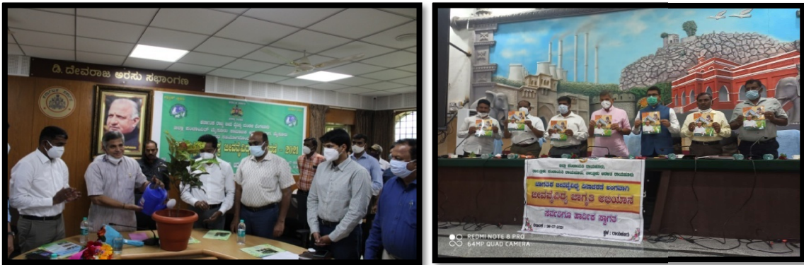
IBD Celebrations at Zilla Panchayath, Mysore and Raichur

Karnataka Biodiversity Board conducted campaigns on the occasion of International Day for Biological Diversity with the theme of " We're part of the solution " at all places across the state from 15 th July, 2021 to 15 th August, 2021. As a part of this campaign the activities in the field were awarded and felicitated at district levels.