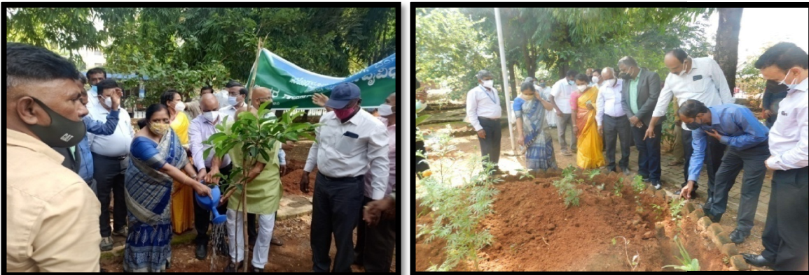
IBD Celebrations at Zilla Panchayath Bangalore Urban District