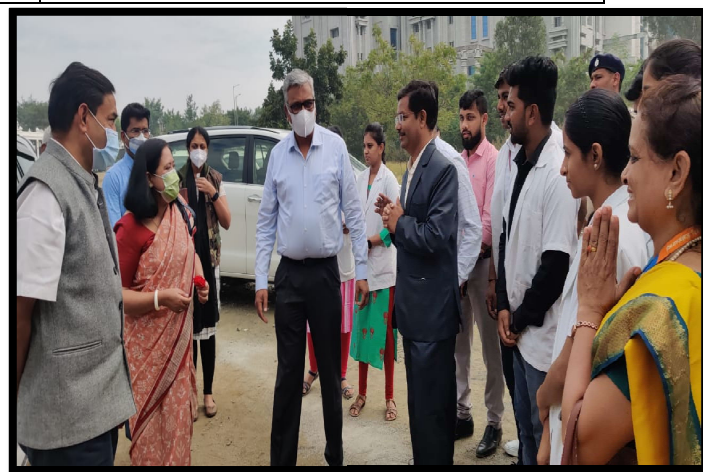
Training for Kalaburagi Circle Forest Officers and Frontline Staff